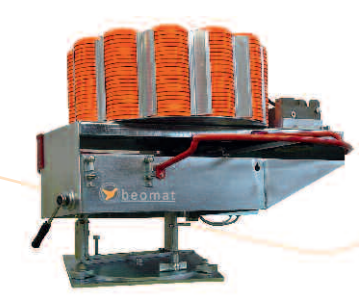
Tyr Mot 250