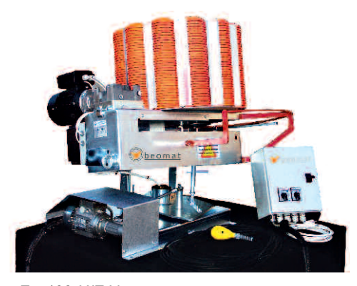
Tor 400 MJT Hunting