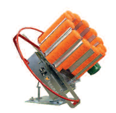
Freja MSS 400 Teal