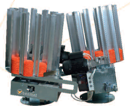
Oden MS 700