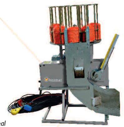
Balder 210 Revolver Teal

A trap that will launch standard clay targets straight up. Also adjustable to lower angles.