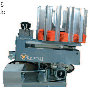
Tor MT 400 Automatic

The trap is intended for Automatic/Continental Trap with a launch trajectory of 80 m, but can easily be adjusted to standard trap just by change of the main spring, and adjustment of the vertical motor to the desired launch angle.