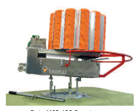
Freja MSS 400 Sporting

This launcher is intended for battue targets and has a 500 target capacity. Built with well-tested components with the same features as Freja 400 sporting.